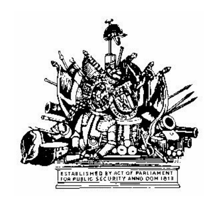
THE GUARDIANS OF THE BIRMINGHAM PROOF HOUSE

The London Proof House, 48 Commercial Road, London E1 1LP